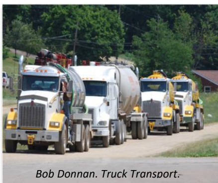
Bob Donnan. Truck Transport.

Since public health depends on what is in the air where people are breathing, aggregating over geographical regions is most appropriate for public health.