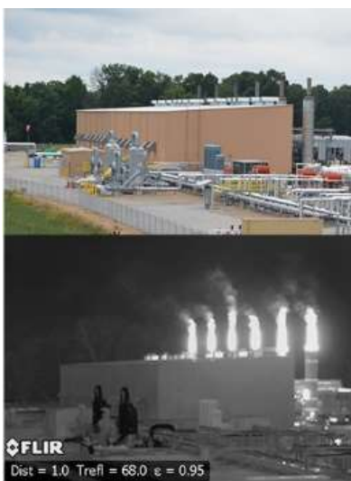
Earthworks - Compressor station emissions containing VOCs made visible with a FLIR Camera

What are VOCs? Organic compounds are chemicals that contain carbon and are found in all living things. Volatile organic compounds, referred to as VOCs, are organic compounds that easily change from liquid to vapors (fumes) or gases at room temperature. They are emitted from oil and gas sites including but not limited to well pads, compressor stations and pigging stations. Diesel trucks which go back and forth from sites are big emitters of VOCs. VOCs are also released from liquid fuels such as gasoline or kerosene, as well as from burning fuel such as gasoline, wood, coal, or natural gas. Additionally, they are released from solvents, paints, glues, and other products that are used and stored at home and work.